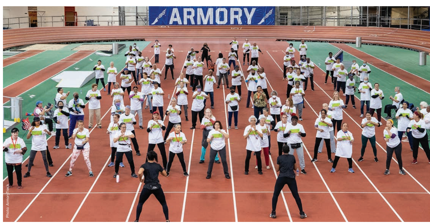
Seniors in the AIM High program have been bringing the energy each and every week.