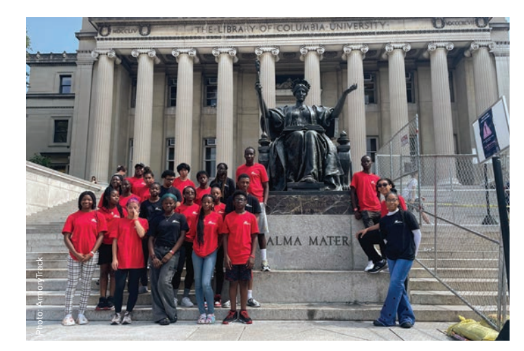
Students visited Columbia University on one of several college tours that ACP organizes each year.

Our Armory College Prep (ACP) program is vital to our mission of "Keeping Kids on Track." Fewer than three guarters of New York City high school students go on to attend college after graduation, and that number is significantly lower in the schools of underserved communities that many of our students attend. For the seventh year in a row, 100 percent of our graduating seniors have been accepted to a four-year college, while also