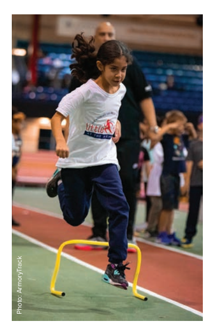
Our young athletes in the Little Feet program working on sharpening their hurdle skills.

The Armory Foundation is committed to providing no-cost track and field programs to the youth of Upper Manhattan, and the CityTrack, Little Feet, and Tiny Feet programs have continued to thrive. The goal of these programs is simple: providing local children with the opportunity to run, jump, and throw in a safe