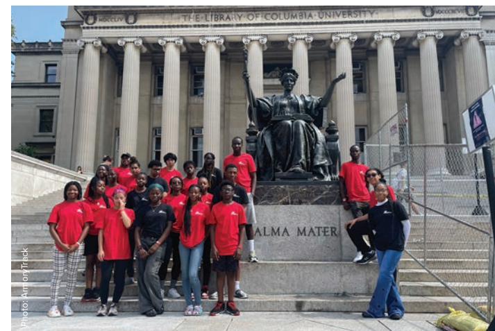
Students visited Columbia University on one of several college tours that ACP organizes each year.

Our Armory College Prep (ACP) program is vital to our mission of “Keeping Kids on Track.” Fewer than three quarters of New York City high school students go on to attend college after graduation, and that number is significantly lower in the schools of underserved communities that many of our students attend. For the seventh year in a row, 100 percent of our graduating seniors have been accepted to a four-year college, while also