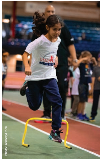
Our young athletes in the Little Feet program working on sharpening their hurdle skills.

The Armory Foundation is committed to providing no-cost track and field programs to the youth of Upper Manhattan, and the CityTrack, Little Feet, and Tiny Feet programs have continued to thrive. The goal of these programs is simple: providing local children with the opportunity to run, jump, and throw in a safe environment led by terrific and caring coaches, all at no cost to participants. We aim to develop exercise habits and nurture a life-long love for personal health in neighborhoods that struggle with high poverty rates and the associated risks to child well-being. Over 60 percent of participants are children of color, reflecting the wonderful diversity and culture of Upper Manhattan.