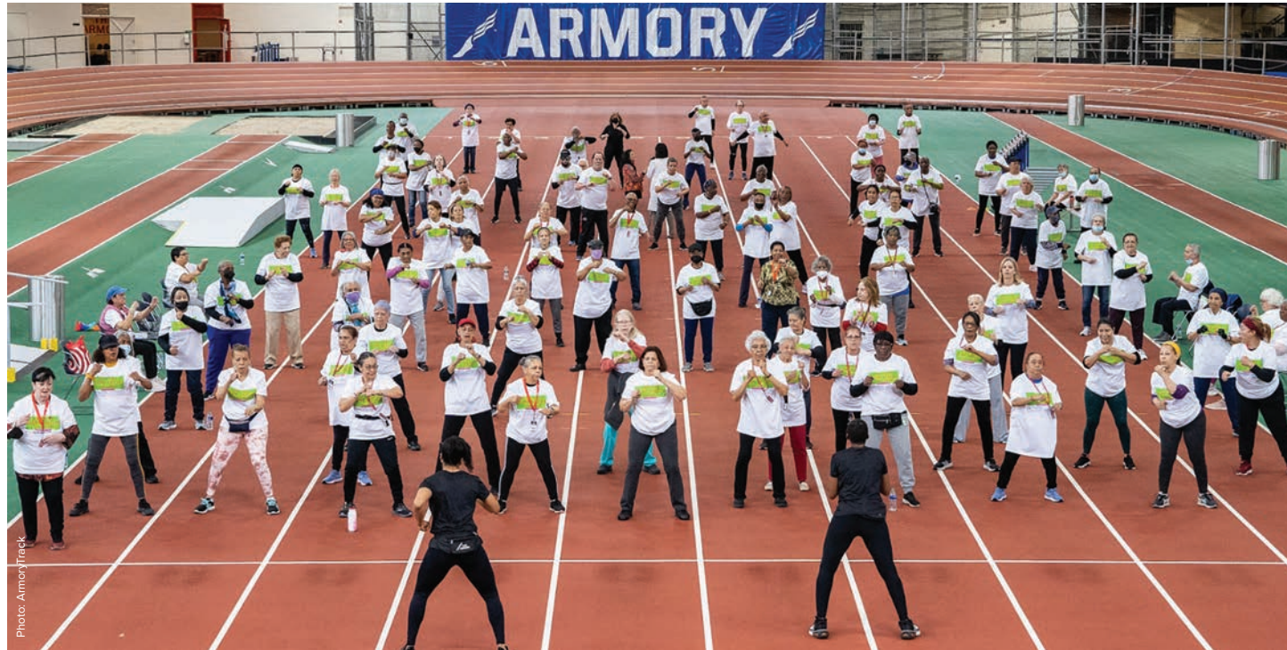
Seniors in the AIM High program have been bringing the energy each and every week.