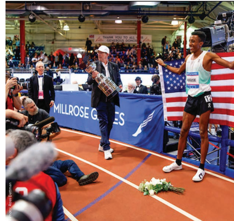
Yared Nuguse celebrates after smashing the American Record in the mile.

As always, ACP remains completely unscreened and free of cost, accepting any and all students who train at The Armory. Our staff works tirelessly to fill in the educational gaps, providing a well-rounded curriculum with emphasis on Math, English, test prep, personalized college counseling, and creative arts. We remain committed to making a difference in the lives of our students through equitable access to education.