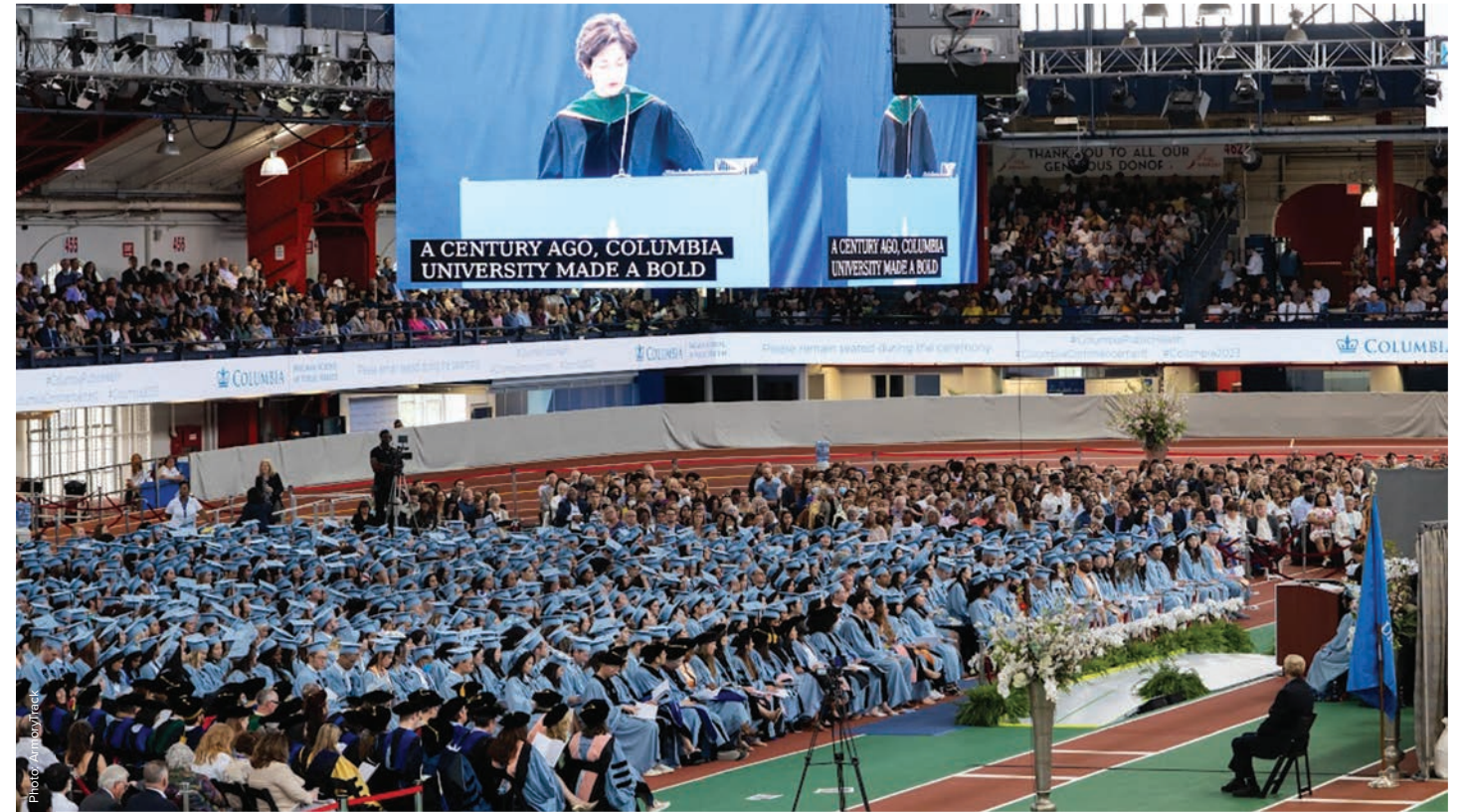
Numerous graduate schools at Columbia University hold their commencement ceremonies at The Armory each year.

We are delighted to see rapid growth for Seniors AIM High throughout the year, and we look forward to expanding our community outreach efforts to the young and old alike!