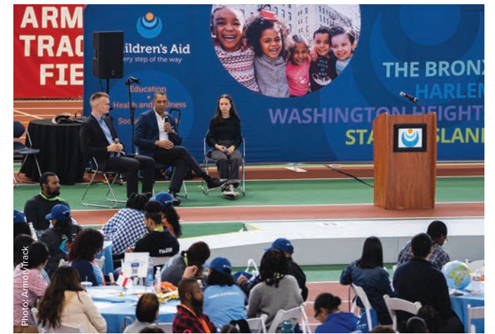
The Armory hosted an event for Children's Aid this past June.

at the Columbia University Irving Medical Center and NewYork-Presbyterian Hospital. Whether it is an expo event, lecture series, or large corporate event, The Armory has the space to accommodate any type of get-together. All of these events help to support our youth programs, both educational and athletic.