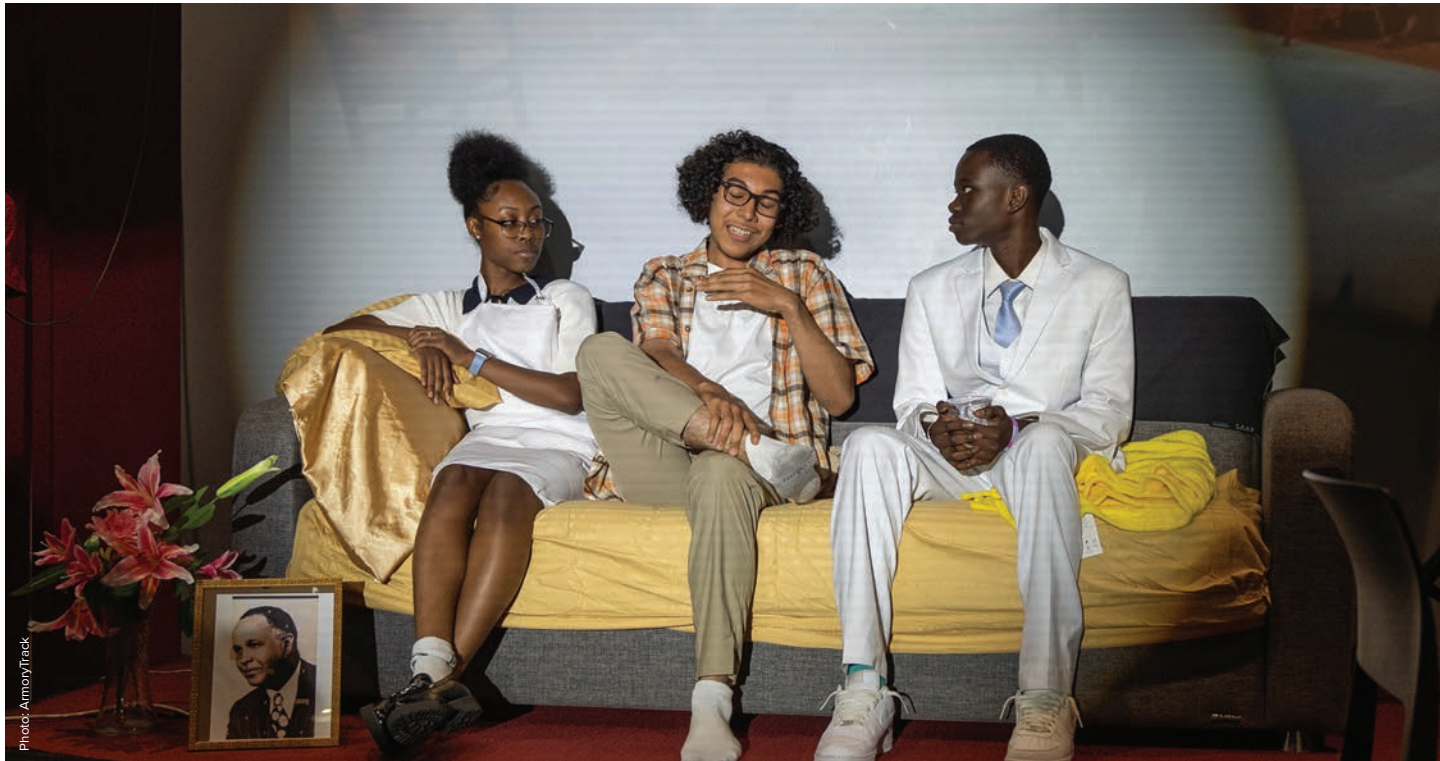
For the annual Summer Showcase, ACP students put on a production of A Raisin in the Sun by Lorraine Hansberry.