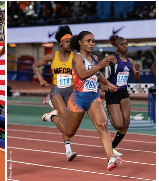
A sprinter from Benjamin Cardozo HS strides away from the competition.